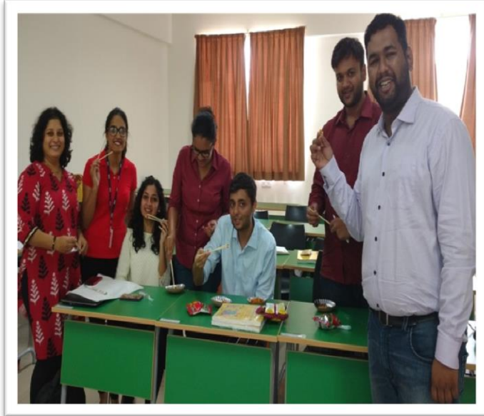
Mastering the art of chopsticks