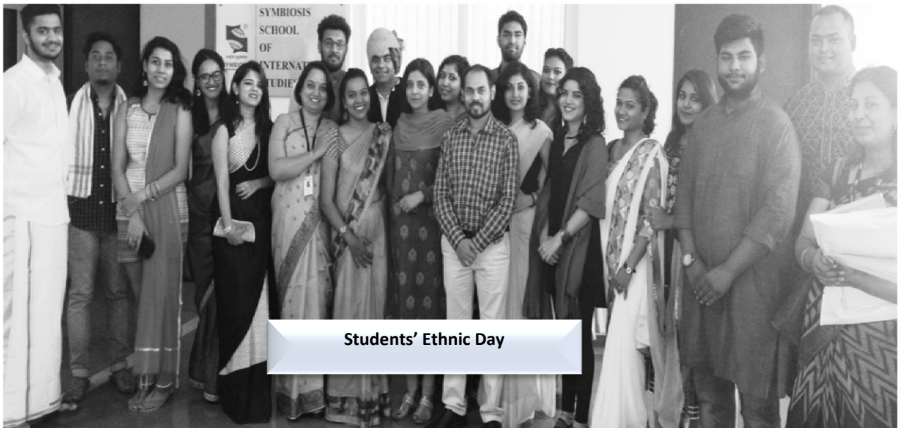
Students' Ethnic Day