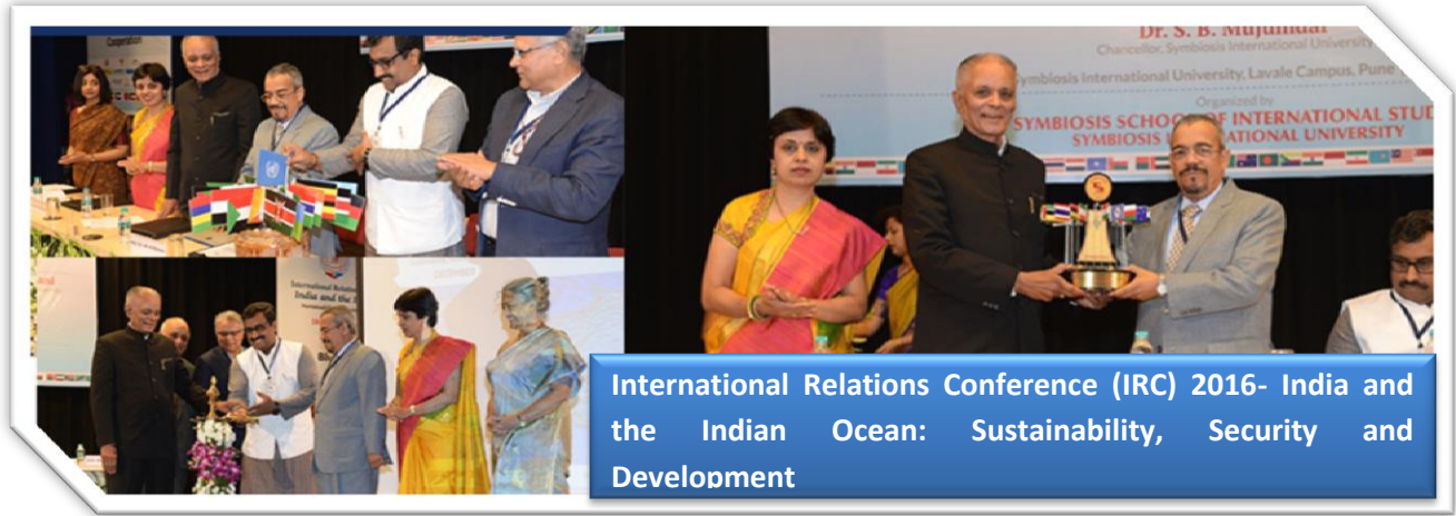
International Relations Conference (IRC) 2016- India and the Indian Ocean: Sustainability, Security and Development